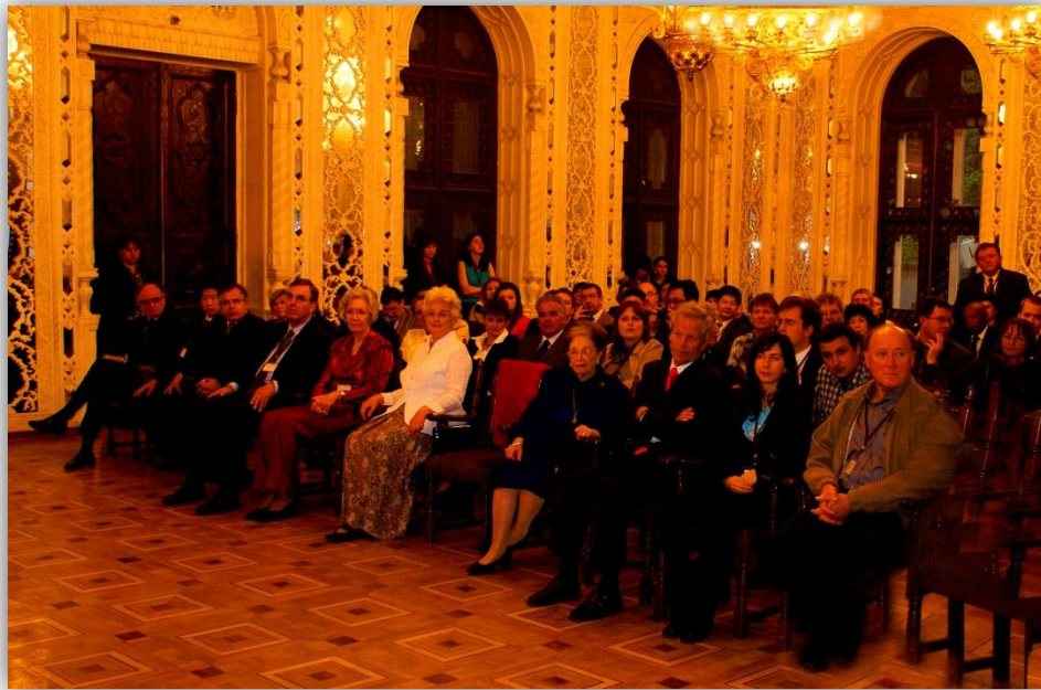
Ceremony at the Youth Palace

The ceremony was followed by a Concert of the Best Young Participants of the « IV Georgian Competition of Musician-Performers » (2007) at the Conservatoire Recital Hall. The prize winners were all under 16 years: